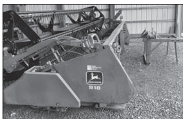
(1996) JD 918 PLATFORM LOCAL TRADE