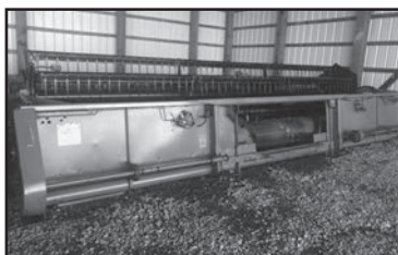
(1989) 920 PLATFORM