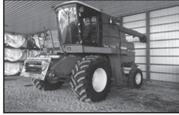
(1984) JD 7720 COMBINE, 4340 HRS