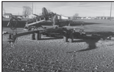
31 FT ROLLING HARROW