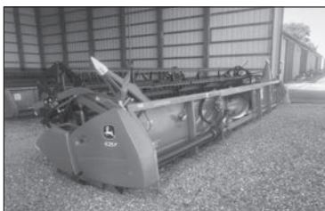
(2011) JD 625 F