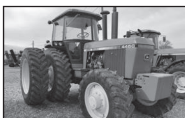
(1983) JD 4450 140 HP 7576 HOURS