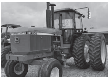
(1990) JD 4555, 156 HP, 5287 HRS