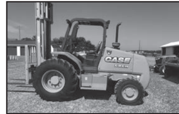
CASE 586H FORKLIFT 2884 HRS.