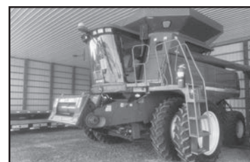
(2004) JD 9660 3260 ENGINE HOURS, 2231 SEP HOURS, 4 WD