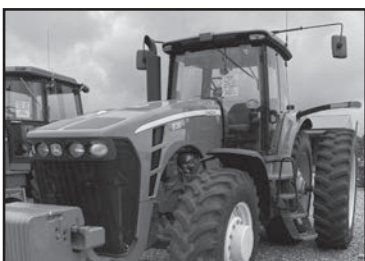
(2009) JD 8130, 180 HP, 2566 HOURS