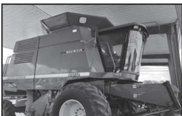
JD 9510 (1998 MODEL) 2 WD, 3842 ENGINE HOURS, 2839 SEP HOURS