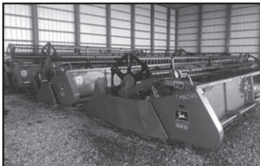
(2) 925 PLATFORMS 1995, 1999