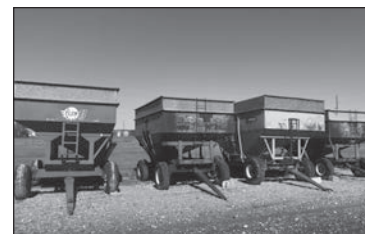
SEVERAL FUNNEL BODY WAGONS