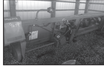
JD 893, 1996, W/KNIFE ROLLS AND HYDRAULIC DECK PLATES